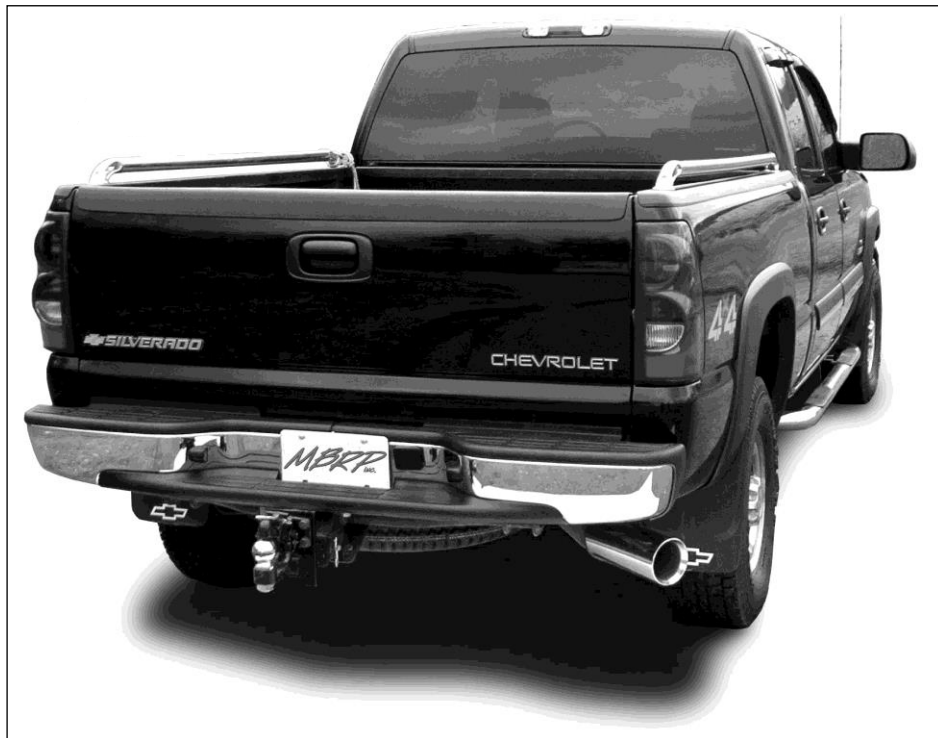
"PRO SERIES" exhaust shown.

Congratulations! You are ready to begin enjoying the improved performance and driving experience of your MBRP Ltd. performance exhaust system. We know you will enjoy your purchase.